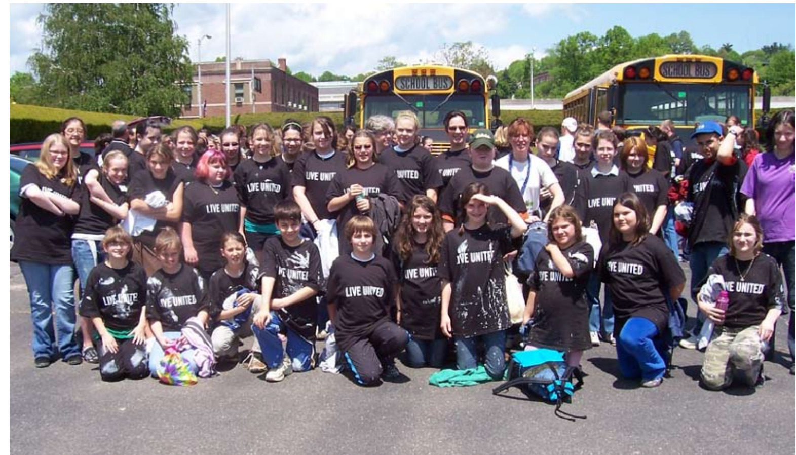
After United Way’s Day of Caring on May 15, 2009, some of the Kids in the Middle students from Bristol, Burlington, Plainville and Plymouth gathered for this picture.

There was a student at the Middle School of Plainville who was painfully shy and introverted. He was not at all comfortable in social situations. He was given one-on-one time but more importantly, he was encouraged to join KIM. Through KIM he has grown tremendously in his confidence and ability to interact with peers. He joined the morning announcements club and read the announcements to the whole school. He participated in a KIM project where he volunteered at the Oak Hill special education school. He would help run errands, interact with the students and help the teachers. He said, “This was a great opportunity to volunteer, and I can’t wait for next year.” He also participated in the United Way Day of Caring. This is a child who does not like to get dirty and has a hard time working as a team. He did an awesome job at Shepard Meadows Farm. He worked with the other students, shoveled gravel, moved hay and smiled through it all. His teachers have noticed that he is trying harder in group situations although it is still not his favorite activity! He is eager to help with KIM errands and busy work and often stopped by to see if he could help out. This young man has grown and developed skills through his being involved in KIM that he might not have otherwise had the opportunity to develop.